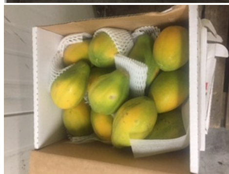
GroFeds 1 st trial shipment of export papaya to Fresh Direct in NZ