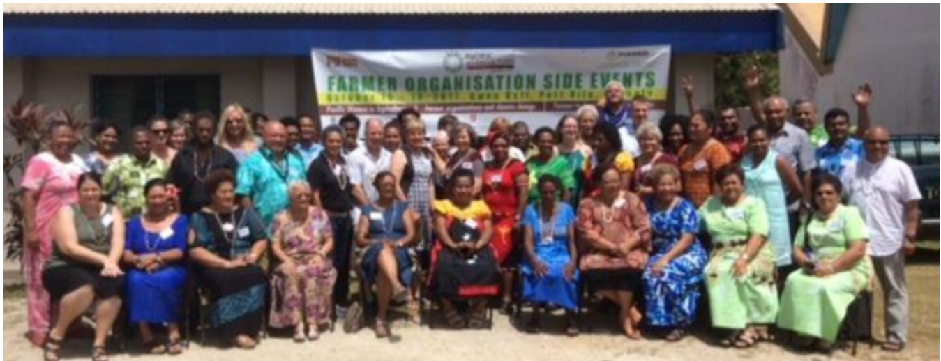
Participant delegates at the Women in Agriculture Day One workshop at the Owen Hall, Port Vila, Vanuatu during the Pacific Week of Agriculture activities

This was the first ever Pacific Week of Agriculture and this was held on 16 – 20 October at the National Convention Centre in Port Vila, Vanuatu.