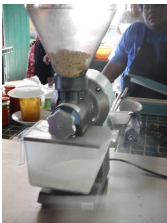
Dried chips into breadfruit flour