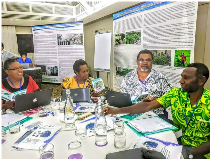
PIFON members at the PIRAS Annual Forum discussing best practices in research and extension

The event was co-organized with the Global Forum for Rural Advisory Services (GFRAS) and the South East Agricultural Research Centre (SEARCA). Approximately 50 participants attended the event which was held over a span of three days from 29– 31 August 2017 at the Novotel Hotel in Nadi, Fiji.