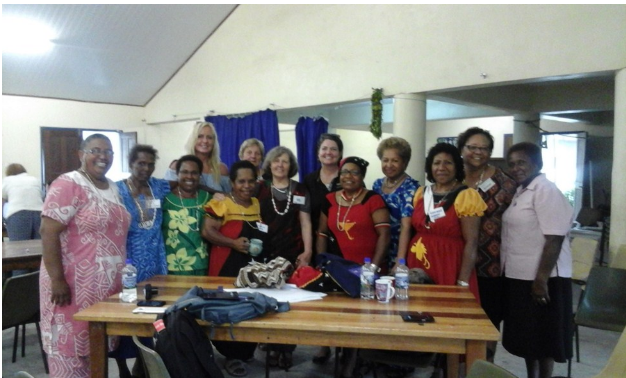
Participant delegates at the end of Day One of the Pacific Women In Agriculture workshop pictured above at the Owen Hall, Vanuatu

The event was organised by the Pacific Islands Farmers Organisation Network (PIFON) in partnership with the Pacific Islands Association of Non Governmental Organisation (PIANGO) with funding from the International Fund for Agricultural Development (IFAD) under the Medium Term Cooperation Programme for farmer organisations in Asia and the Pacific Phase II (MTCP II) project.