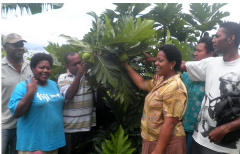
Marcotted breadfruit coming into production just three years after planting

Excitement was generated when new equipment, funded through PIFON, was commissioned to produce breadfruit flour in large quantities. This is used for partial replacement of flour in baking but will eventually find use as a thickener in a range of future products. Simple demonstrations of jam, chutney and pickle making saw delegates sprint out of the starting blocks to mass produce preserves, chips, chutneys and sauces of all flavours. Not only do these items make good use of fruits and vegetables previously going to waste, transformed into products, they will compete against imported ‘junk,’ drinks and snacks. Those made out of local crops have a much higher nutritional value. Exciting sauces and chutneys made from Tutu’s tomatoes, papaya, chillies will add much excitement to the usual dalo, cassava and vudi and will ensure that important nutrients such as vitamin C, vitamin A and fibre are added to diets. Cordials and juices have been made entirely from local crops. Such is the interest that there is much anticipation that these wonderful products will eclipse such dietary demons as two minute noodles and the cola range of drinks.