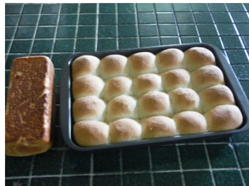
Delicious and nutritious breadfruit bakery products made from breadfruit at Tutu