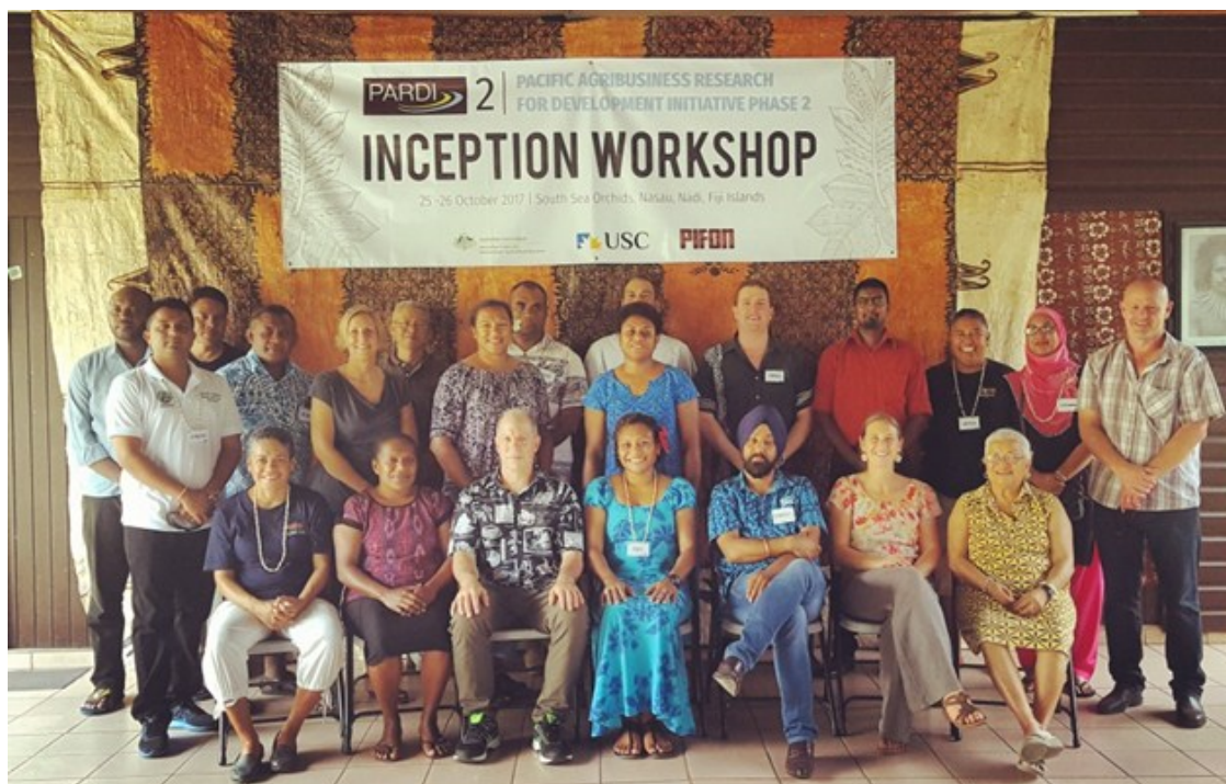
PARDI 2 Inception Workshop participants at South Sea Orchids, Nasau, Nadi

Approximately 30 participants attended the workshop and included representatives from the various Pacific partners namely, SPC, USP, PIDF, PIPSO and Pacific Island Government Ministries, Australian Government development and trade initiatives such as PHAMA, MDF, M4C, and related donor and NGO activities and agribusinesses (private sector) in the Pacific.