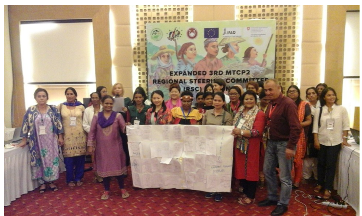
Participants of the Asia Pacific Women's Forum presenting their Declaration to the members of the RSC Meeting in Ahmedabad, India