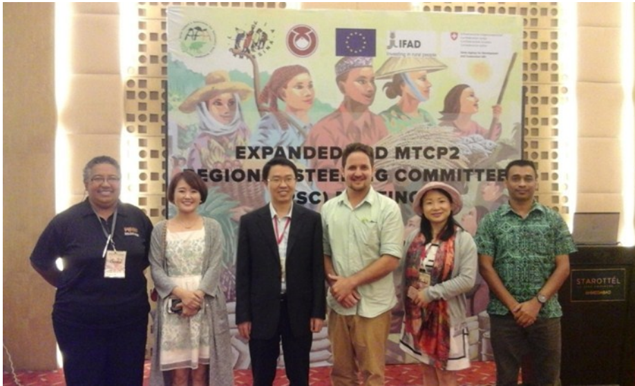
The Pacific delegation pictured with the Chinese delegation at the closing ceremonies of the ERSC held in Ahmedabad, India