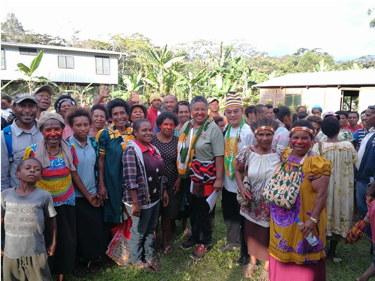
SIS team members pictured with members of the Koswa PNG WiA group who run their very own Jiwaka Ecotourism Centre, Koswa village, in the highlands of Jiwaka Province, PNG

In Lae, the SIS members met with PNG WiA staff and NARI officials including the Director General of NARI to , reaffirm the commitment of the MTCP II program for PNG WiA. The NARI/PNG WiA partnership was a highlight finding for the SIS Mission and an exemplary remark made at the ERSC Meeting in Ahmedabad, India on Lessons Learnt from the Pacific SIS Mission.