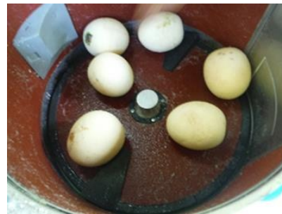
State of the art peeler used at Tutu for breadfruit