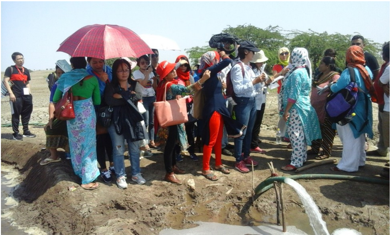
Participant delegates visiting the salt farms for the Federated Salt Farmers in the remote deserts of Ahmedabad, pictured here on site at one of the bore holes pumping out salt water from 26 feet deep below for salt farming, water pumped had 16-20% salinity, and needed to achieve a 25% salinity for market requirements.

The participants were also able to take time out to visit the home of the late Mahatma Gandhi, a famous son of Ahmedabad.