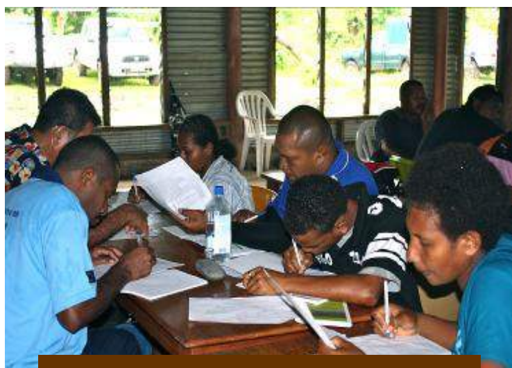
Soil Schools training in a classroom setting on Taveuni

PIFON members, TTT and Tutu, in their own efforts to alleviate their soil issues have, through donor funds from other programmes, conducted soil schools for their farmers to educate them in biological approaches to farming. They have also, through the expertise of an Australian agronomist worked with 40 farm groups to further their knowledge and