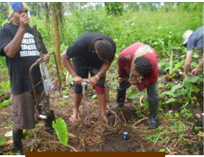
Soil testing on a taro farm on Taveuni

It is generally understood that to implement sustainable practices is no small task and will take years of education, finding local affordable solutions and perhaps most importantly facilitate a change of the current mindset.