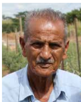
Sant Kumar Bula Agro Enterprise