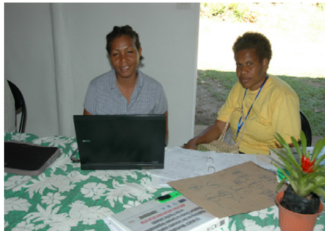
Farmer organisations from the Solomon Islands share experiences on proposal writing at a PIFON training on ‘Business Models for Farmer Organisations’ held in 2012