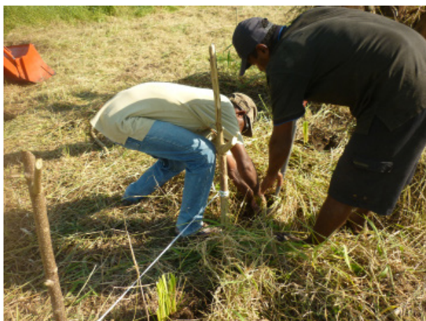
PIFON has facilitated the transfer of soil conservation strategies from Vanuatu to Fiji through farmer to farmer exchanges

A strength of these regional networks is the sharing of experiences. Both cases also highlighted the need for a network to address the practical issues at the farm level in order to maintain an interest in the network. A key lesson from both of the regional farmer organisation coordinating bodies is the need for a strong secretariat. A regional network cannot be effectively run by volunteers with existing management roles in their own national organisations. On this basis, a challenge for a regional farmer organisation network is securing long term funding for a paid secretariat to ensure that the work of the organisation is consistent.