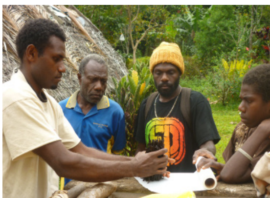
Farm Support Association (FSA) in Vanuatu plays a critical role in linking small spice farmers to Venui Vanilla through training and an organic internal control system.

To a large measure, the future economic well-being of PICs will depend on the degree to which small-holder farmers are able to take advantage of these opportunities. FOs are seen to have a key role to play in making this linkage.