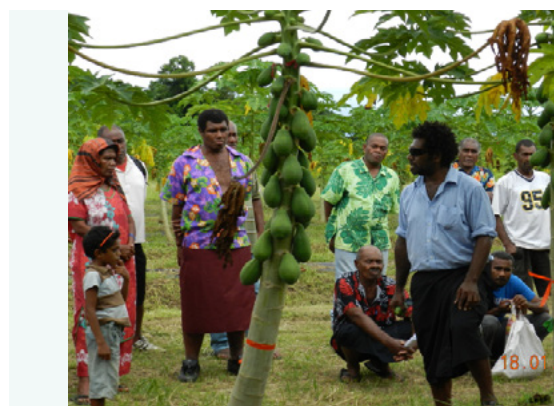
Nature's Way Cooperative in Fiji provides quarantine treatment for fresh exports of papaya, eggplant, breadfruit and mango and also runs a small research and extension service for its members